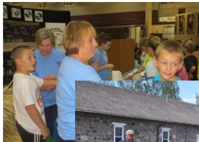
Northern Prairie Water Festival &