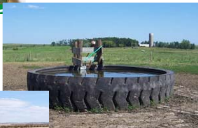
Improving grazing operations with pipeline and tanks