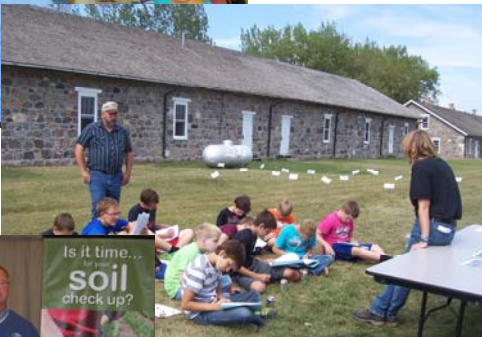
Eco-Ed Day at Fort Sisseton