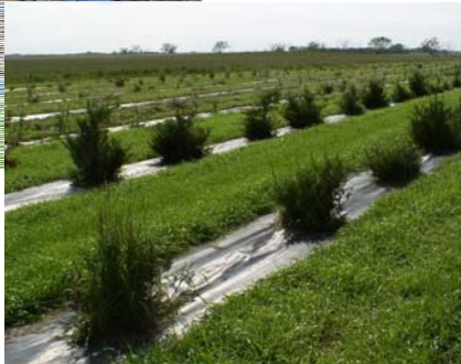
Applying weed barrier fabric to tree planting