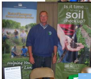
Britton Winter Festival