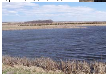
Implementing practices to improve water quality in area lakes